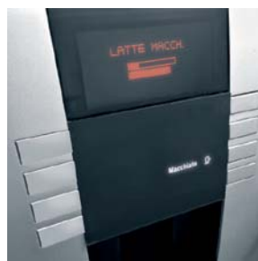
Simply user friendly